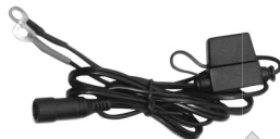
Fused Connection Lead